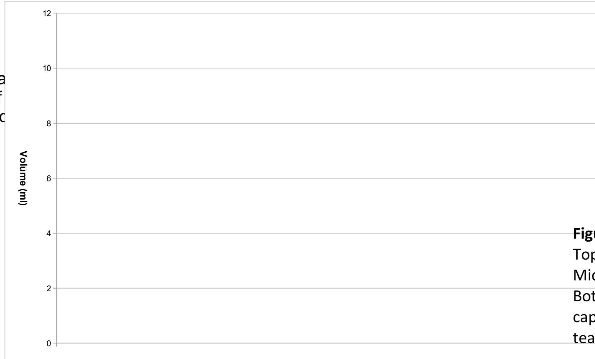
Graph 1: Drop Volume by Bore Diameter